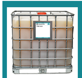
270-gallon tote SKU: E925/NR270P UPC-12: 641238073741