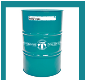
54-gallon drum SKU: E925/54 UPC-12: 641238073680