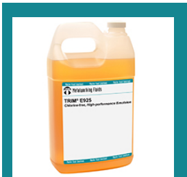
1-gallon jug SKU: E925/1 UPC-12: 641238073703