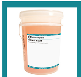
5-gallon pail SKU: E925/5 UPC-12: 641238073697